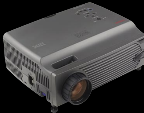
ThinkVision C400 Wireless projector

Recommended for: K-12 and higher education classroom presentations, government institutions and meetings, large hall or large hotel conference rooms and commercial ceiling installations.