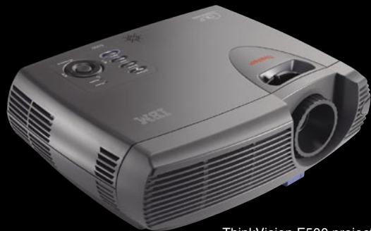
ThinkVision E500 projector

Recommended for: K-12 and higher education classrooms; government institution meetings, small or medium hotel-based conferences or events, mobile presentations, sales or other small meetings, novice use requiring reasonable pricing. Can be ceiling mounted.