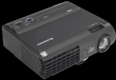
Lenovo M500 projector