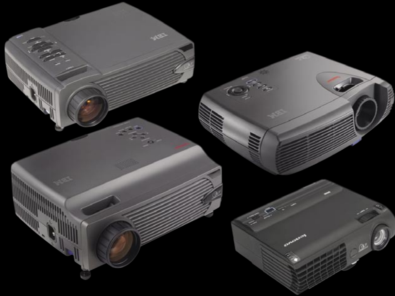
Lenovo family of projectors: C400, C400 Wireless, M500 and E500 projectors

Using auto-sensing technology that picks up video signals from Lenovo 3000 and Lenovo ThinkPad® notebooks, Lenovo projectors let you make a bigger impression, faster and more confidently than ever before.